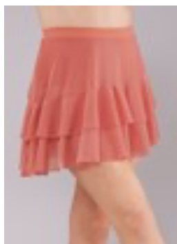
Level 3 Lyrical