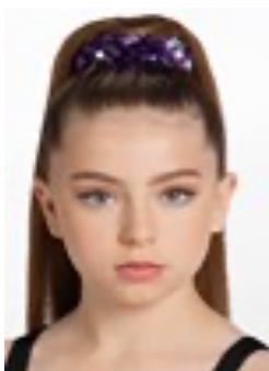
L4 Tap Hairpiece