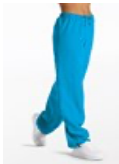
L2 HH Pants