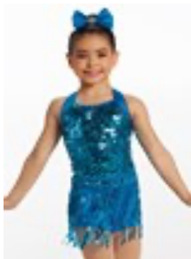
Level 2 Ballet/Tap/HH