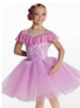
Level 3 Ballet