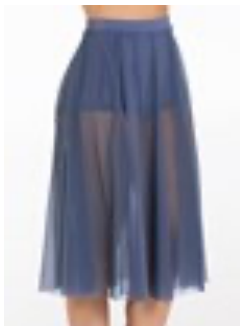
Level 5 Lyrical