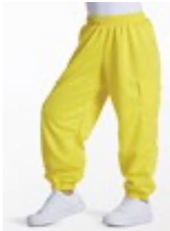
Level 3/4 HH - Colors Turquoise AND Yellow