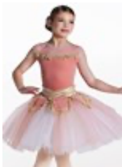
Level 6 Ballet