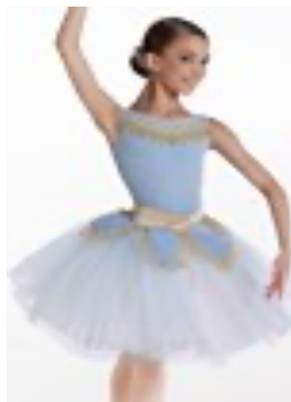
Level 5 Ballet